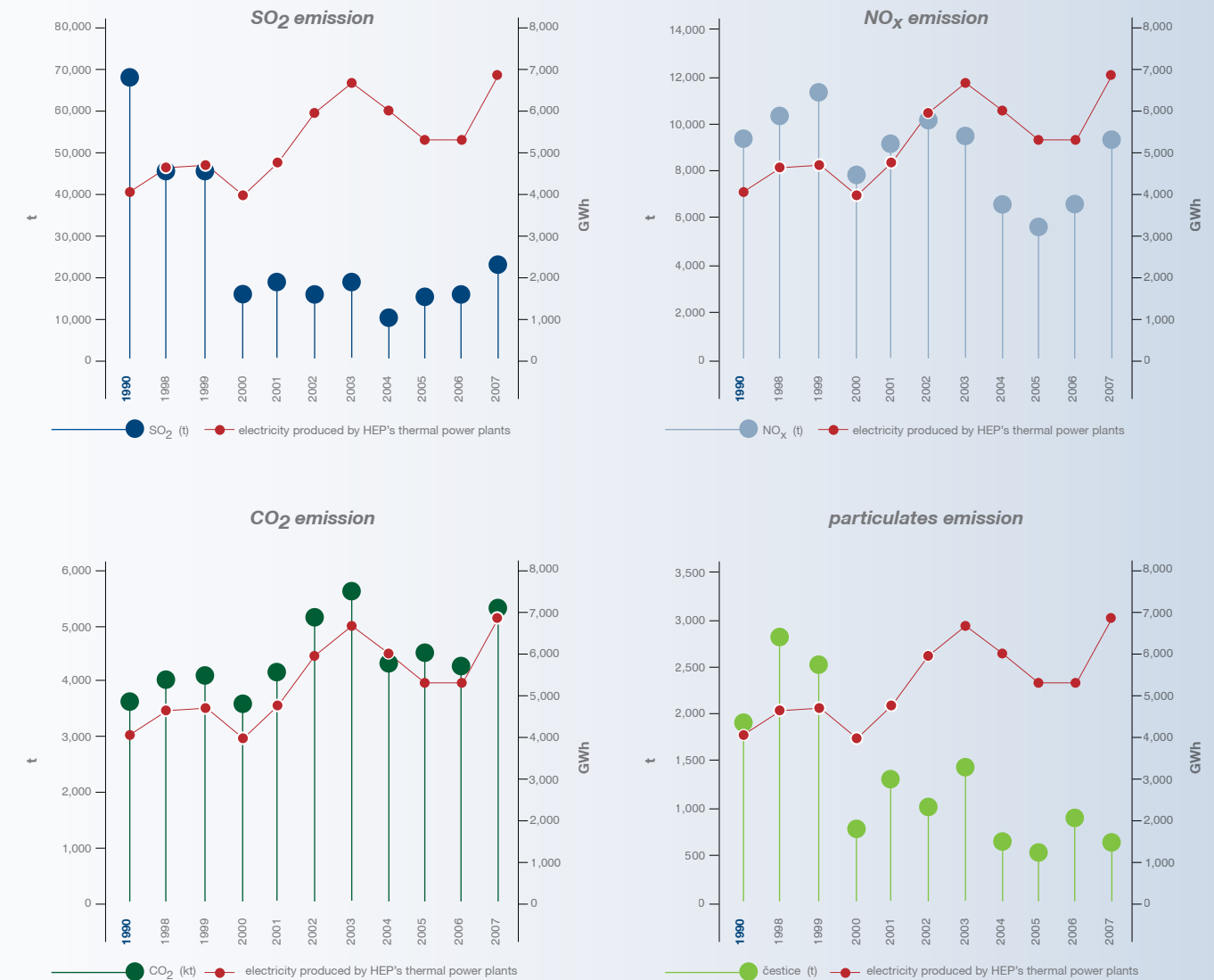
Trend of pollutant emissions from HEP's thermal power plants (1990) 1998-2007